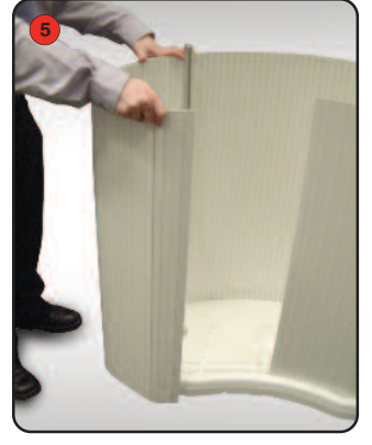
Take the tambour wrap and insert the bottom edge into the grooved guide on the base. Ensure the tambour is fitting securely into the groove.