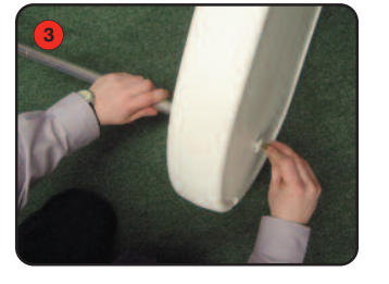
Fit pole assembly through hole in the base and push one of the screws through from the opposite side. Ensure the pole and screw are securely fastened together.