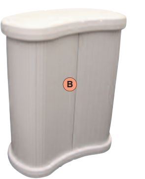
Full wrap style counter