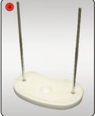
Repeat step 3 for the other pole and then place the base on the floor.