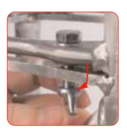
Attach the wing nut to secure the arena sections in place.